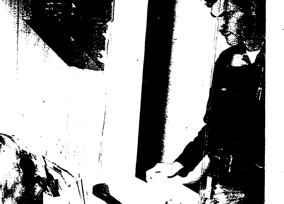
NEW OFFICE SPACE - Police departments in both Novi and Wixom underwent a facelift recently that resulted in more office space and a more efficient use of available floor area.

Wixom is in its second year of a three-year police contract.