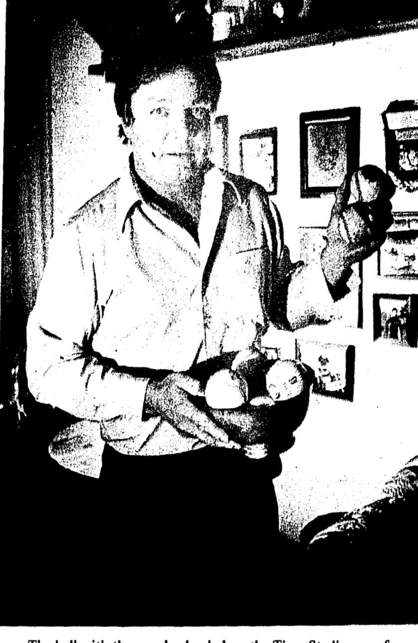
The ball with the smudge landed on the Tiger Stadium roof

Cash landed a job with the American Broadcasting Company system in 1976 as a member of the Monday Night Baseball back-up game commentating crew. His partners at ABC were World Series foe Bob Gibson and play-by-play man Al Michaels.