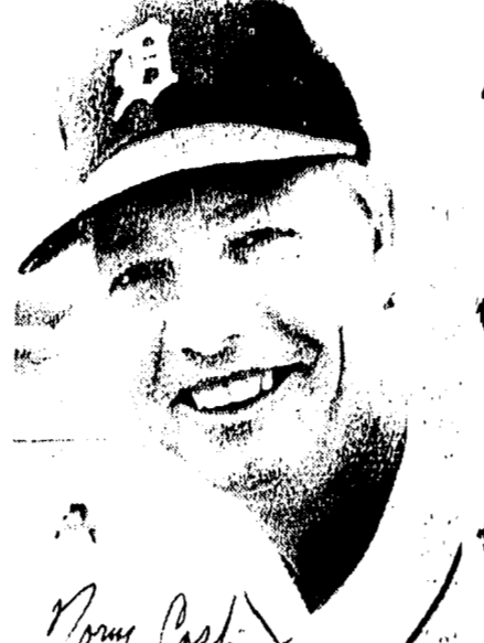
Tiger postcard 1972