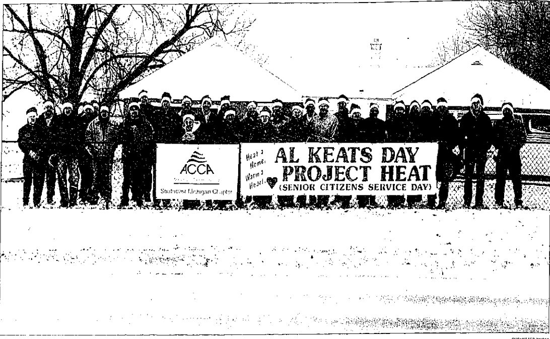
About 25-30 technicians of Southeast Michigan Air Conditioning Contractors of America gathered at Day & Night Heating & Cooling in Novi before making about 75 service calls...