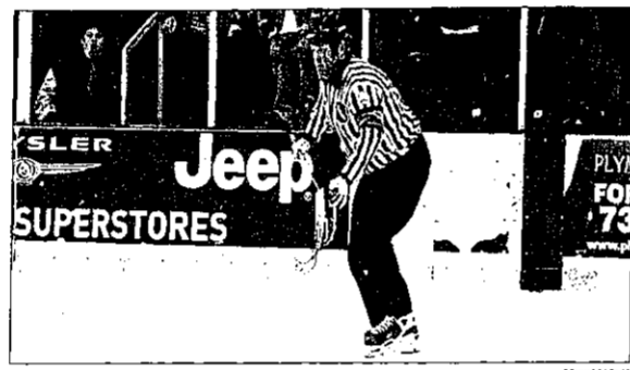
Northville resident and Detroit Red Wings head coach Mike Babcock saw a familiar sight from the stands at Compuware Arena when the Northville-CC hockey game was temporarily suspended after an octopus came flying out of the Northville student section.

CC lost its first game of the year 4-3 to U-D Jesuit two days earlier. The game hurt huge student turnouts for