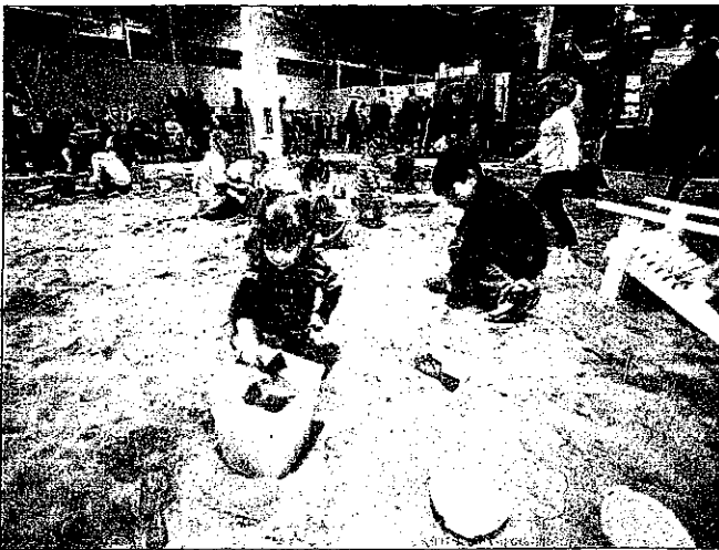
Attendees of the Cottage & Lakefront Living Show coming to Novi next week will have the opportunity to turn a pile of sand into sandcastles at The Beach, a giant sandbox complete with sand and carving tools.

An actual full-size cottage home with a loft will be built on the exhibit floor by Distinct Discovery Homes of Greenville