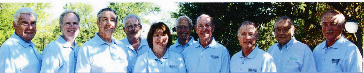
The 2012 Oakland County Parks and Recreation Commission.