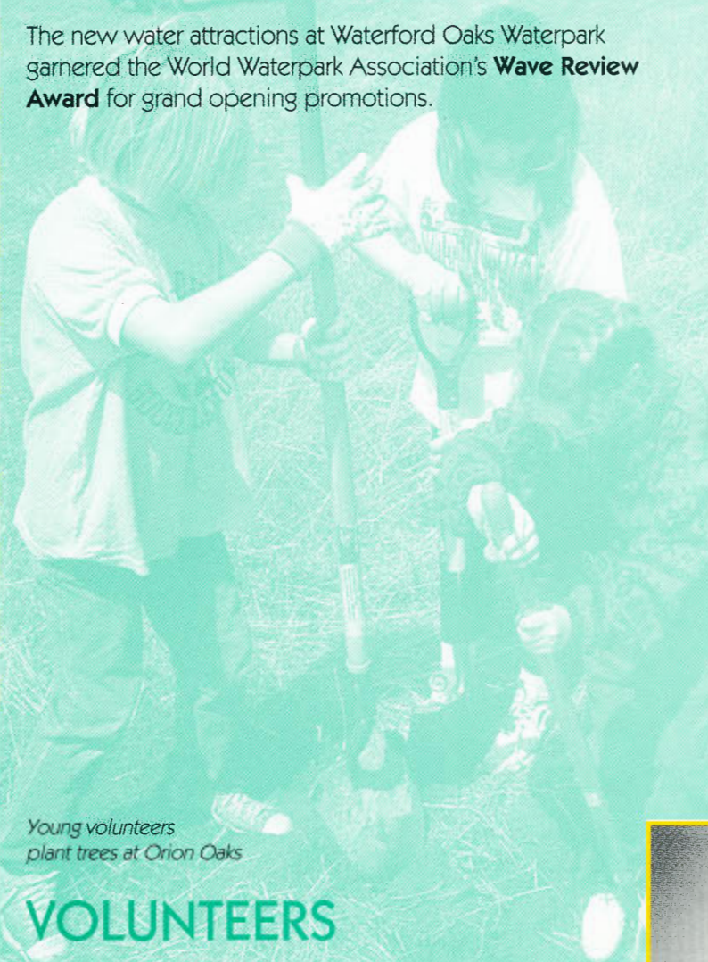
Young volunteers plant trees at Orion Oaks

The new water attractions at Waterford Oaks Waterpark garnered the World Waterpark Association's Wave Review Award for grand opening promotions.