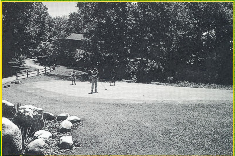
Golfers enjoy a challenging game and beautiful surroundings

Major parking lot improvements at Glen Oaks included expansion to accommodate 100 additional vehicles, landscaping and complete repaving. In addition two new toilet facilities were installed on the golf course.