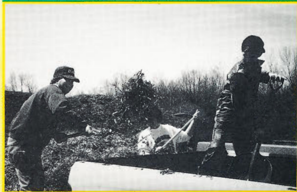
Loading up with free woodchips at Orion Oaks

...Nearly 1.5 million people visit the Oakland County Parks each year.