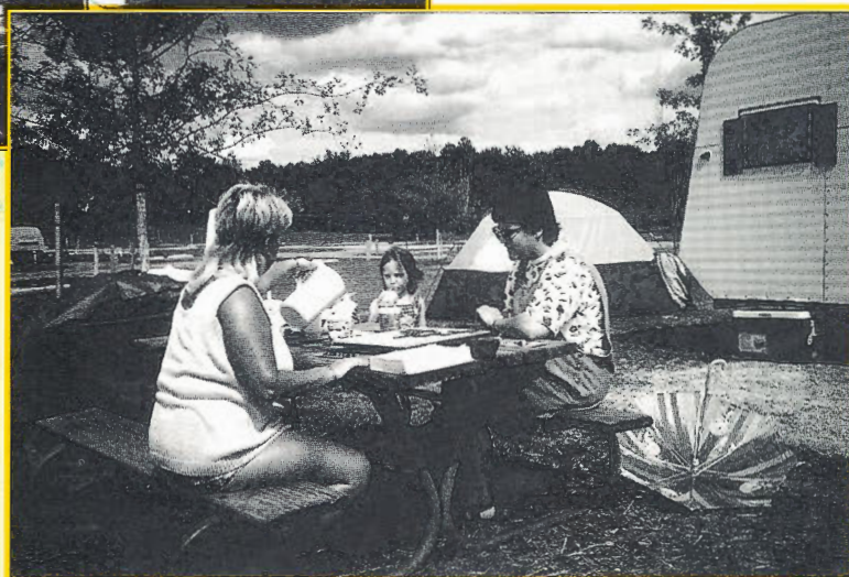
Camping is more convenient than ever at Groveland Oaks