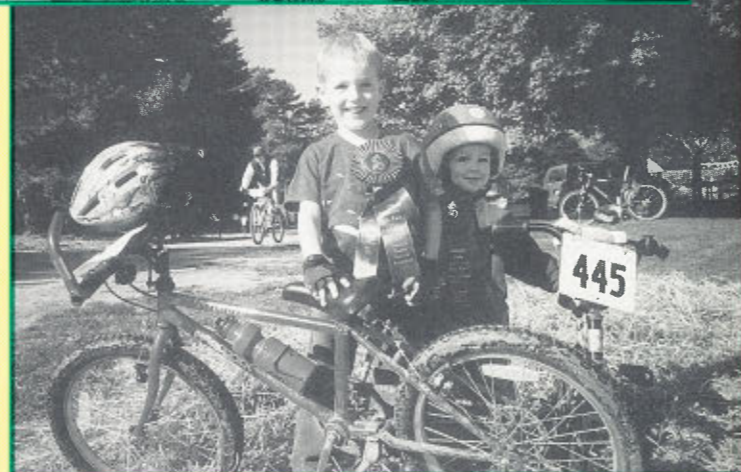
Even small fry compete for fun at Mountain Bike Races!

Mobile Recreation provided special Theme Weekends at Groveland Oaks and Addison Oaks campgrounds throughout the summer. Themes included: Wild West Weekend, Beach Bop, Campground Carnival, Blues Bash and many more.