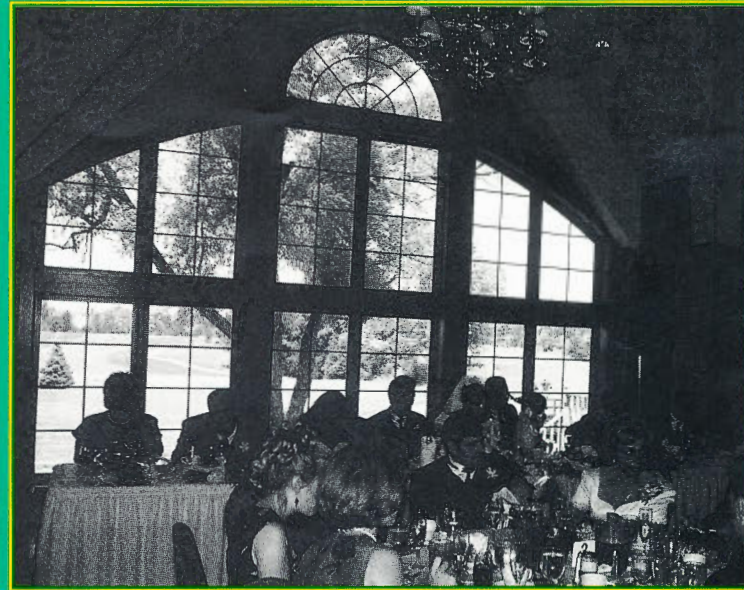
Banquets are even more elegant at the newly-renovated Glen Oaks Clubhouse