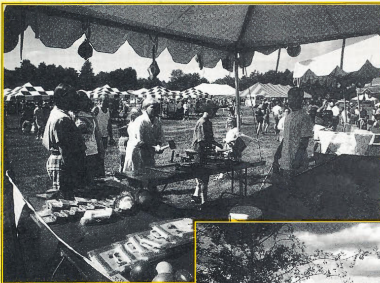
Your group can party at our place!

Nearly four miles of park perimeter fencing was completed at Rose Oaks , the system's newest park. In addition, work has begun on an eight-mile trail system; paths were cleared and orientation signs have been installed.