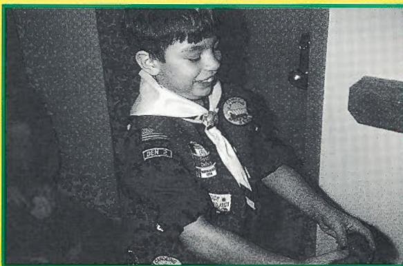
Nature Center staff helps Scouts earn their stripes

New "Badge Days" for scout groups attracted 115 participants in 1997. Naturalists assisted scouts and leaders in earning badges in areas of nature and outdoor education.