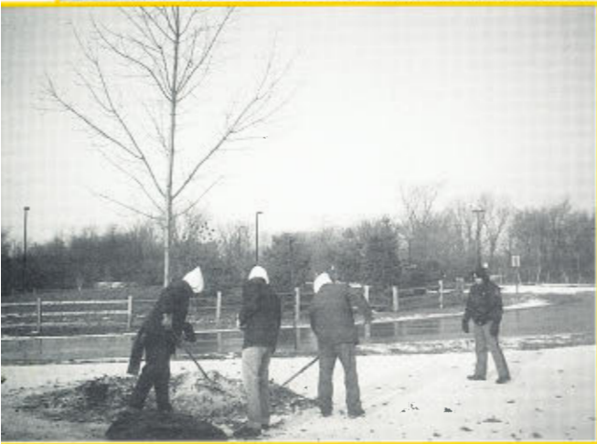
Trusty inmates provide labor, with savings for taxpayers

The young people running the games and moonwalk, etc. were really great... I was impressed with the neat way [the Mobile Recreation staffers] were dressed, and their wonderful upbeat attitudes. My kids loved them!