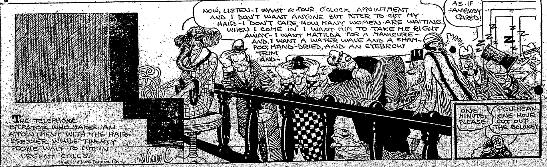
THE TELEPHONE OPERATOR WHO MAKES AN APPOINTMENT WITH THE HAIRDRESSER WHILE TWENTY PEOPLE WAIT TO PUT IN URGENT CALLS.

NOW, LISTEN—I WANT A FOUR O'CLOCK APPOINTMENT AND I DON'T WANT ANYONE BUT PETER TO CUT MY HAIR—I DON'T CARE HOW MANY WOMEN ARE WAITING WHEN I COME IN I WANT HIM TO TAKE ME RIGHT AWAY—I WANT MATILDA FOR A MANICURE—AND I WANT A WATER WAVE AND A SHAMPOO, HAND-DRIED, AND AN EYEBROW TRIM AND— AS IF ANYBODY CARES! ONE MINUTE, PLEASE YOU MEAN ONE HOUR CUT OUT THE BOLONEY