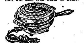
Electric "Chef-Ette" $3.95 A compact cooker that can be used for broiling, roasting, heating coffee or the baby's bottle and many other purposes.

The electric "Chef-Ette" is a new and handy appliance that may be used to broil steaks or chops, roast meats, toast sandwiches, heat coffee, or warm the baby's bottle. Come in and see these appliances today!