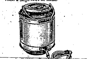
Electric Cookers $5.75 to $12.50 Will roast, bake, broil, steam and stew from any convenience outlet. Portable, they will keep food warm for hours.

The ever popular electric cooker will roast, bake, broil, steam and stew—from any convenience outlet. A complete meal for a family of six can be cooked in the cooker at one time: a roast, a custard, vegetables, potatoes and gravy—can be prepared. It uses little current, and—like the electric roaster above—permits you to go out for the afternoon while your evening meal is cooking.