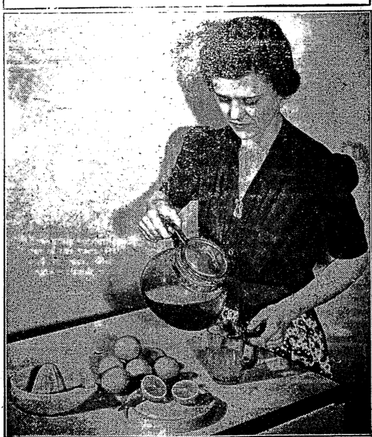
By BETTY BARCLAY