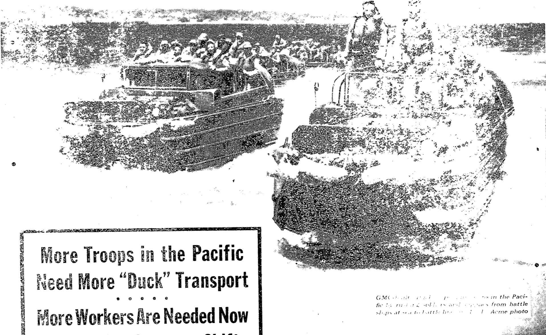
GMC built 400 amphibious trucks in the Pacific theater for U.S. and British troops from battle ships at sea to battle land.

More Troops in the Pacific Need More "Duck" Transport More Workers Are Needed Now on GMC's Afternoon Shift