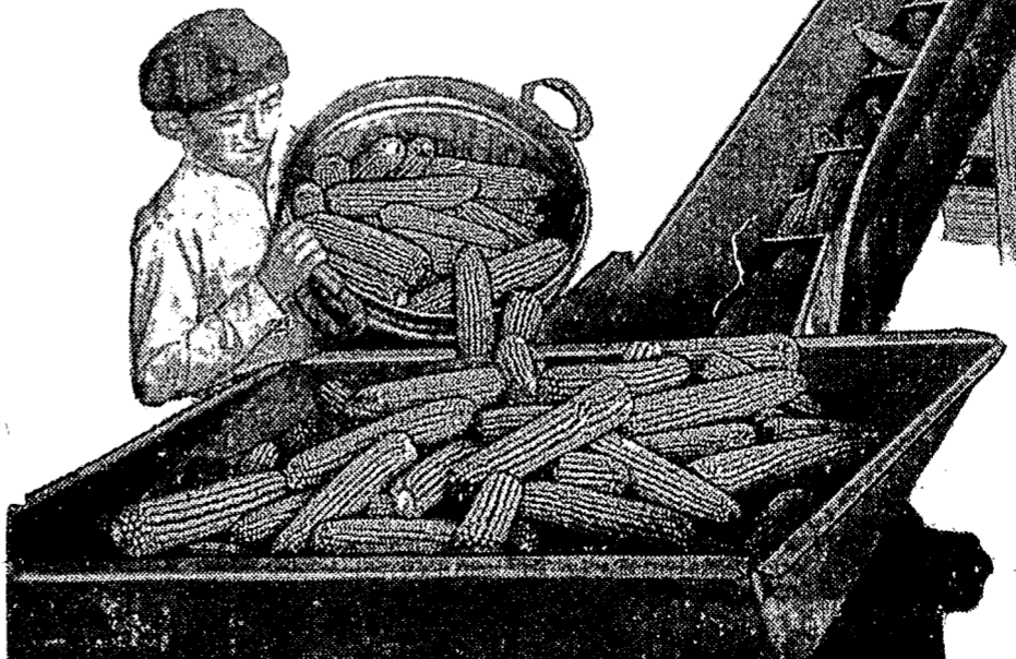
One of the small grain elevators can store five hundred bushels of ear corn an hour—for a penny's worth of electricity!

Talk to your Edison Farm Service Advisor about the grain elevator best suited to your particular job. Ask him to arrange for you to see one of these rugged profit-builders in actual operation on a farm. There you can talk dollars and cents facts to its owner. You'll find that one of these elevators can be practically custom-built to your individual needs. You'll also discover that there are many ways an electric elevator can serve you. Your Edison Farm Service Advisor will be glad to give you sound, conservative, impartial advice — see him today.