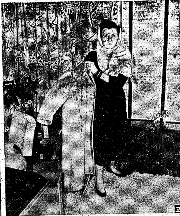
First: close your Venetian blinds immediately. They're maximum protection against shattering glass and will also deflect the rays of the scorching heat flash. Second: don as much protective clothing as possible. Third: seize a towel or any article of clothing to cover your face.

SPORTS I ENJOY - Baseball, Football, Bowling and Basketball FAVORITE KIND OF MUSIC - Popular and Jazz FAVORITE SONG - Brown Eyes and The Aba Daba Honeymoon FAVORITE COLORS - Green and orange HOBBY - Taking pictures FAVORITE FOOD - Chicken PET PEEVE - Going to school FAVORITE ENTERTAINMENT - Bowling and playing ping-pong FUTURE PLANS - Television repair man