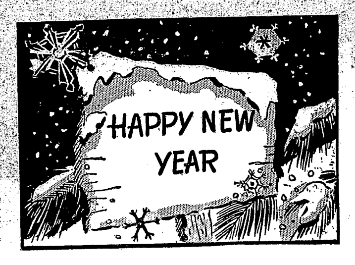
Davisburg Lumber & Coal Co. DAVISBURG, MICHIGAN