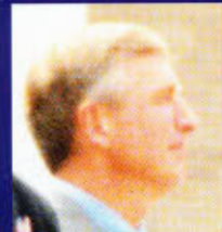
Dick Posthumus Lt. Governor, Michigan