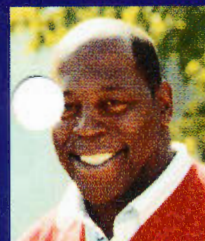
Vinnie Johnson Former Pistons Player