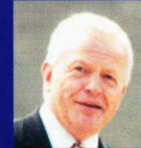
Joe Knollenberg US House of Representatives