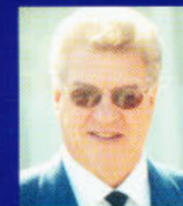
Chuck Daly Former Pistons Coach