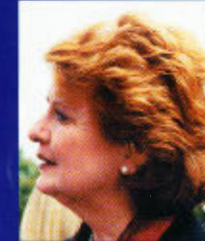
Debbie Stabenow US Senator