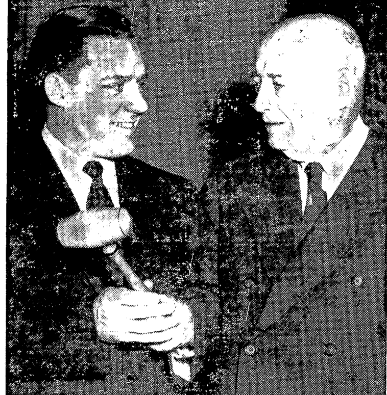
Congressman William S. Broomfield, Republican, of Michigan's Eighteenth District, left, receives from Speaker of the House of Representatives Sam Rayburn, of Texas, the gavel used in the House on George Washington's Birthday. Rep. Broomfield made his maiden speech on that day, when he read George Washington's farewell address. In making the presentation, Mr. Rayburn complimented Rep. Broomfield on his delivery of the forty-five minute speech.