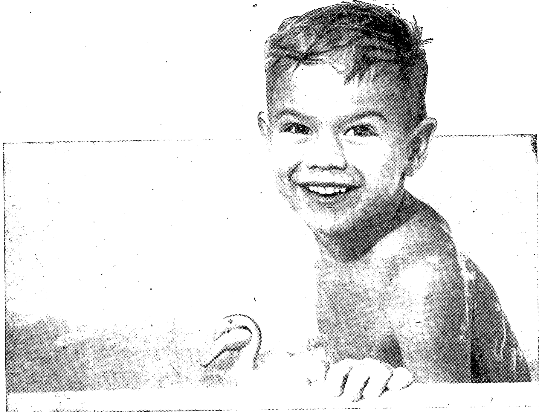
Bath time is fun time with lots of hot water

1957 electric water heaters, built to Edison's rigid specifications, give you all the hot water you want!