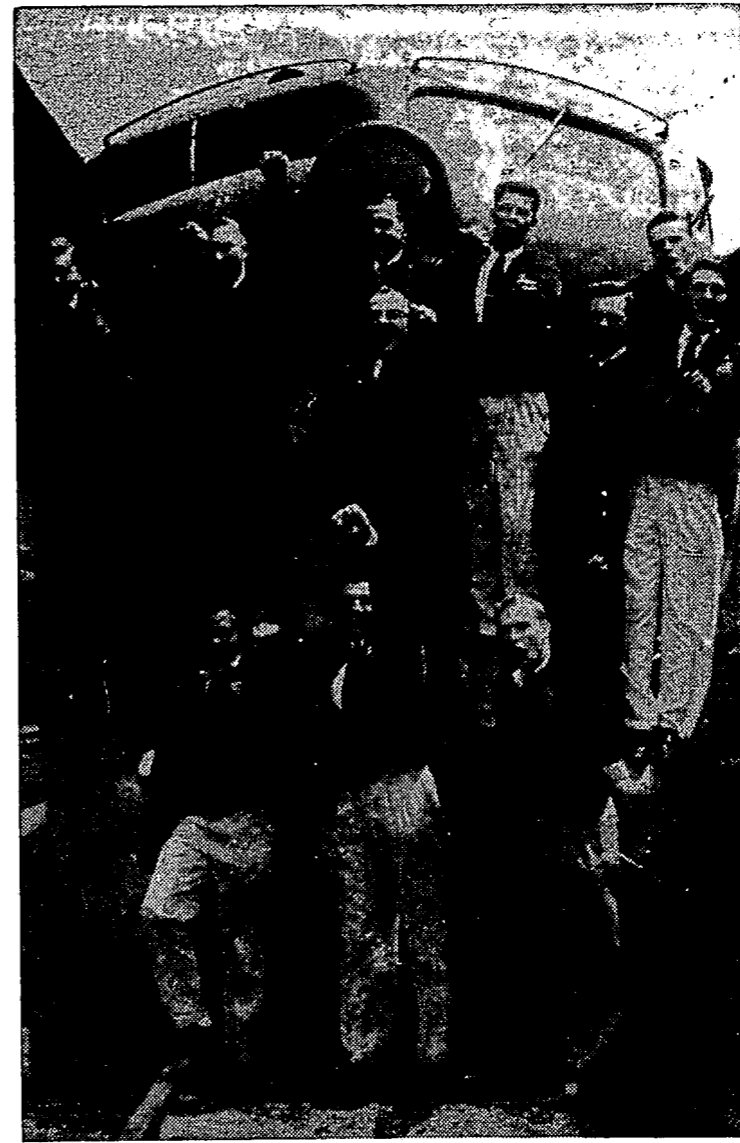
"Farming was never like this!" chorus these 12 Michigan Future Farmers of America as they wave from the face of a huge diesel locomotive during a tour of railroad facilities in Detroit. The state officers, with FFA leaders from Indiana and Ohio, swarmed over the big engine during a recent three-day leadership training conference in the Motor City sponsored by the Eastern Railroad Presidents Conference.

The busy Welcome Week schedule also includes campus tours led by upperclassmen, orientation meetings, tests and examinations, enrollment, registration and social events. An outdoor information post is main-