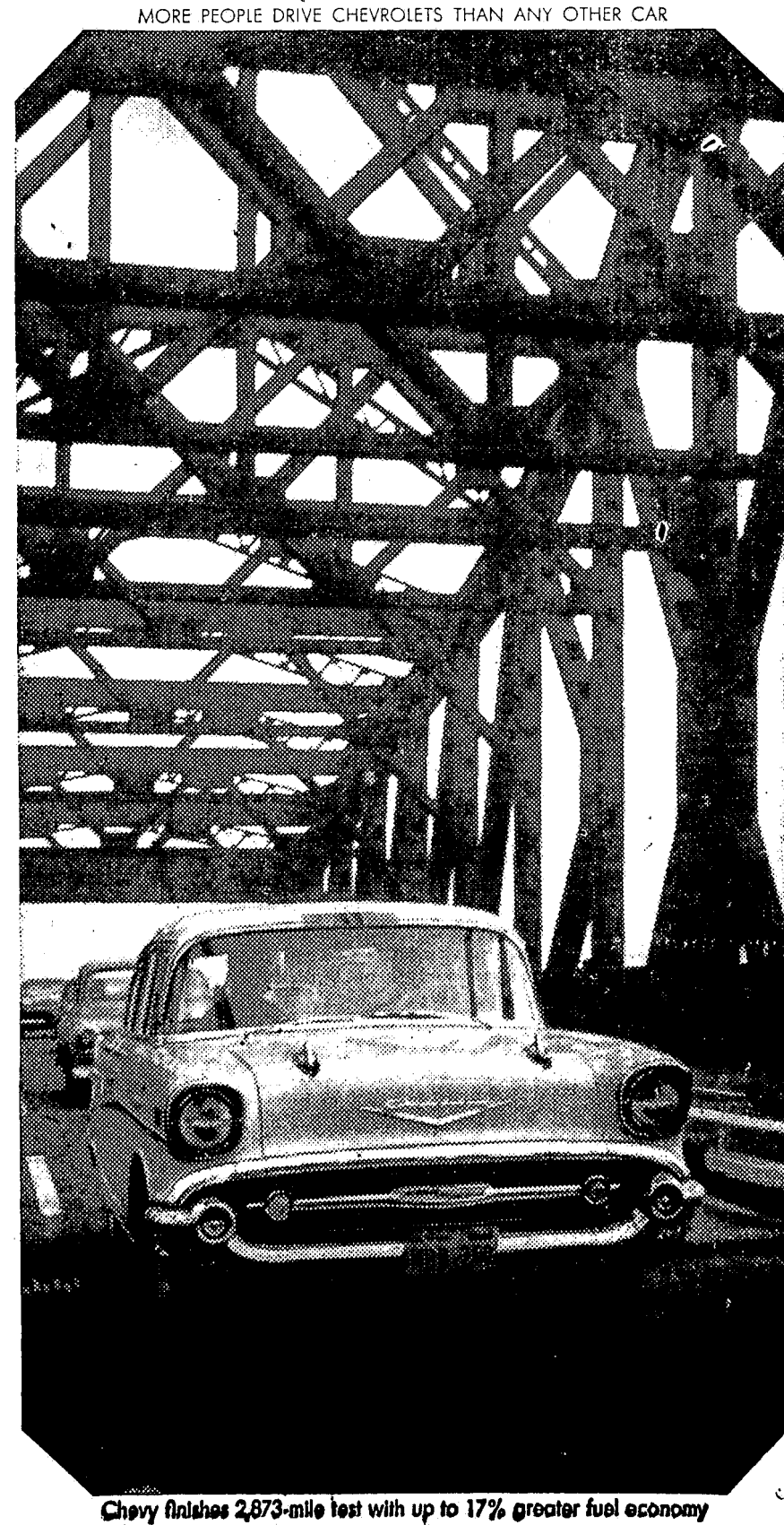
Chevy finishes 2,873-mile test with up to 17% greater fuel economy

See Your Local Authorized Chevrolet Dealer