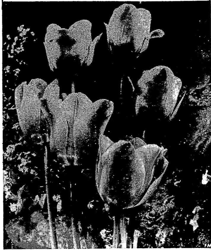
HALF-A-DOZEN TULIPS planted in a clump, like these pink Darwins, provide a bright touch of color against a hedge or in an obscure corner of a lawn. Planted in blocks of single colors or in patterned designs, these Dutch bulb flowers can transform a backyard garden into a color spectacular.

Verel fur-type pile fabrics. However, the combination of the outer fabric and the lining fabric, along with the interlining fabric, is a very important consideration.