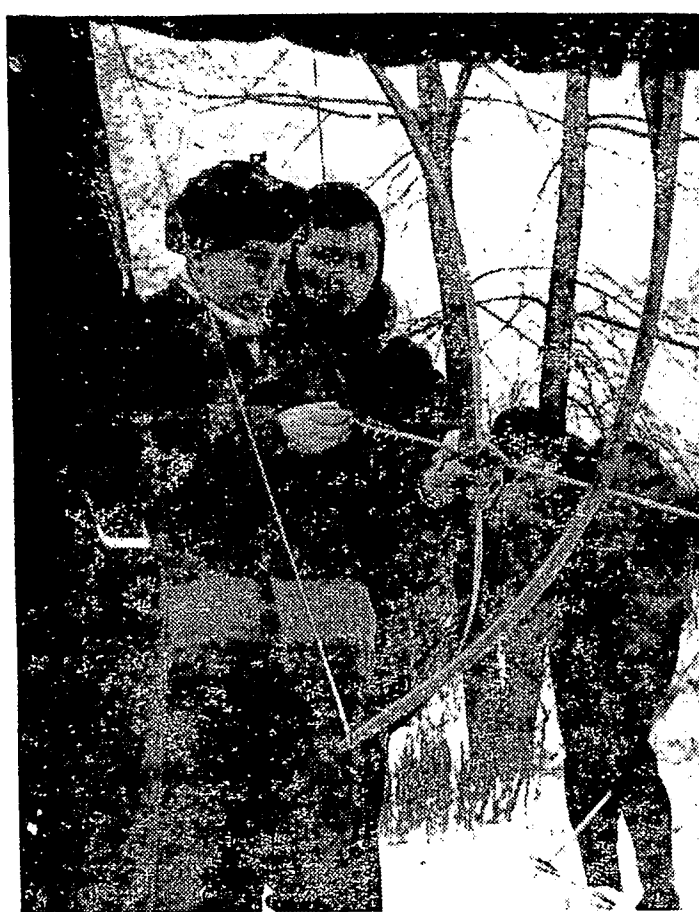
Some 8,000-9,000 youngsters leave their classrooms each winter for a week of education and recreation at Michigan state park outdoor centers.

Morning Worship 11:00 A. M. Young People 6:30 P. M. Evening Worship 7:30 P. M. Wednesdays—Prayer Meeting at 7:30 P. M.