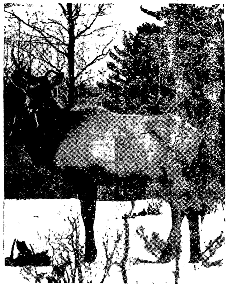
This member of northern Michigan's elk herd stopped a moment for the Conservation Department cameraman before trotting back into his Pigeon River state forest home. The herd is located northeast of Atlanta and numbers 600-700 animals.

said township subject to confirmation of any act of said committee by the Township Board, and for such period as the will of the Township Board of the Township of Independence may suffer and permit.