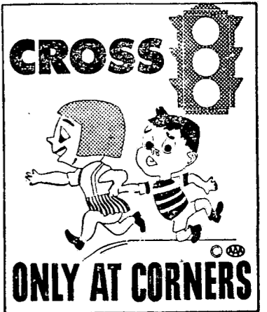
WINNER, THIRTEENTH AAA TRAFFIC SAFETY POSTER CONTEST