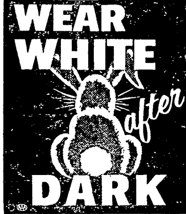
WINNER, THIRTEENTH AAA TRAFFIC SAFETY POSTER CONTEST

Letters had been mailed today to religious leaders throughout the metropolitan area with a self-addressed return card asking for the number of bags that can be used by each religious