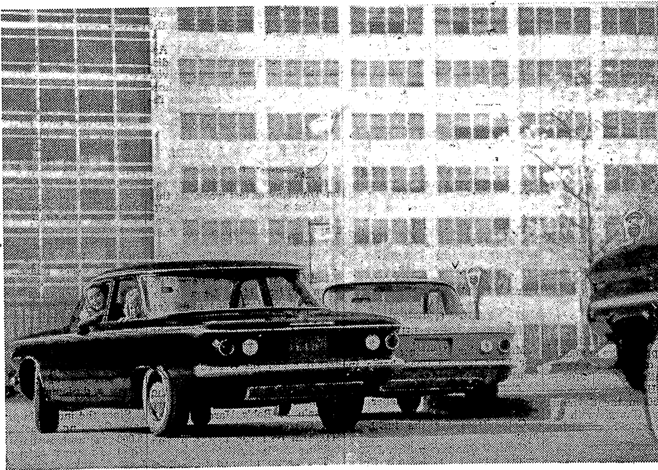
Corvair 700 4-Door Sedan