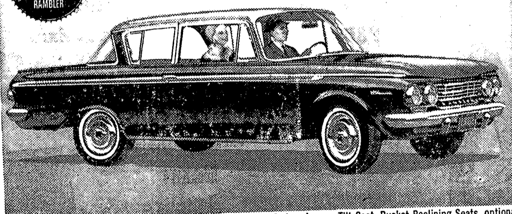
All-New Rambler Classic 2-Door Sedan—Lounge-Tilt Seat, Bucket Reclining Seats, optional.