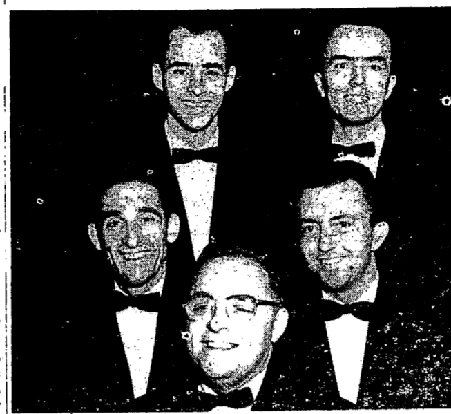
Harbor Lights Quartet