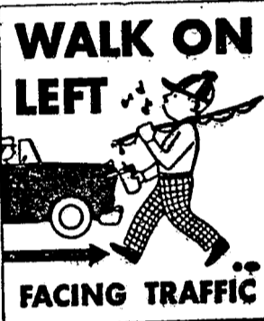
WINNER, FOURTEENTH AAA TRAFFIC SAFETY POSTER CONTEST