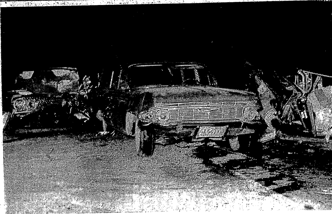
Scene of the accident on M-15 last Friday night in which one woman was killed and two men were seriously injured.