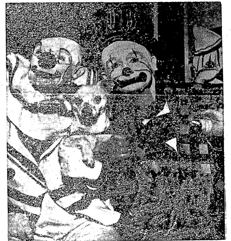
Kiddies and grown ups favorite performers to entertain you at the Famous Cole Circus this 4th of July.