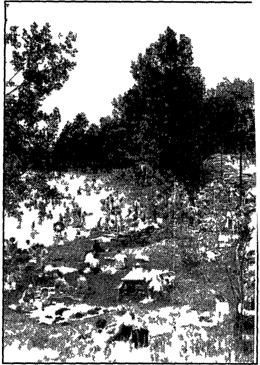
Kelly's Park on Square Lake circa 1940

In the 1990's the acreage off Joslyn Road would be developed as Marina Point Subdivision by Pulte Homes