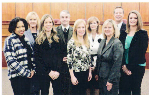
Pictured from left to right: