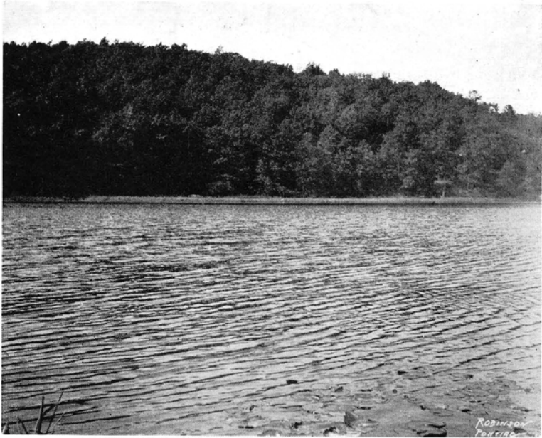
One of the Picturesque Views afforded tourists on improved roads. Orion-Clarkston Road.