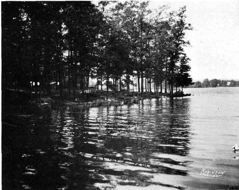
Oakland County rich in her Lake Scenery.

The Oakland County Automobile Club, which has started upon a career of activity, can play a very useful part in the plan for the development of our county and the advertisement of the same. Our county should be mapped, the principal roads named, and signs posted freely, so that strangers in our midst could find their way readily. We possess some of the most beautiful scenery to be found anywhere; if illustrations of these views should be