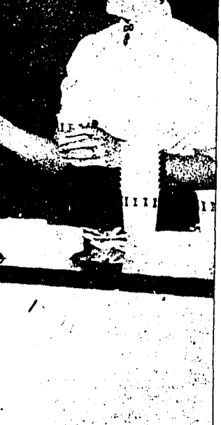
Practicing Pouring - For the expected 1,500 cups of coffee they will serve at the P-TA Carnival tomorrow night...

BLUNK'S INCORPORATED PENNINGMAN AVE. PHONE 1790