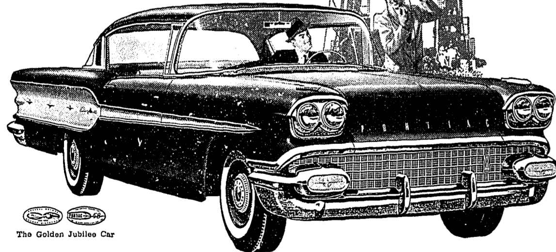
The Golden Jubilee Car

IT'S MORE CARE —with scores of "extras" at no extra cost—oversize tires, Safety Plate Glass all around, crank-operated ventilators, to name a few. So why buy a smaller car when Pontiac gives you more for less? Check into it and see.