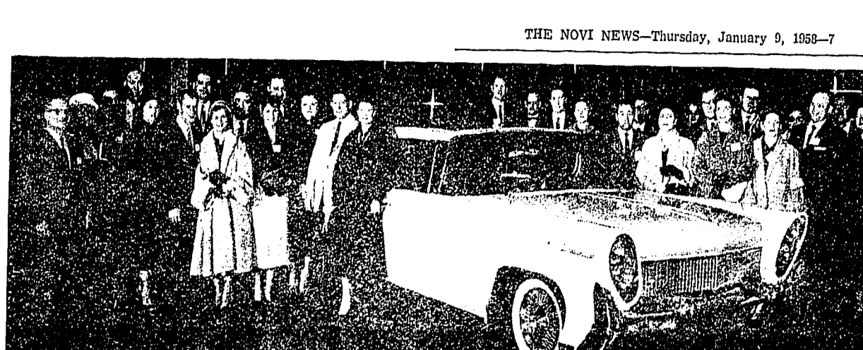
WINNERS OF A NEW CONTINENTAL MARK III and their families visited the Lincoln plant in Wixom last week to place an order for the Continental of their choice. The 15 winners were vacuum cleaner distributor representatives, who participated in a nation-wide sales contest for the Scott and Fetzer company of Cleveland.