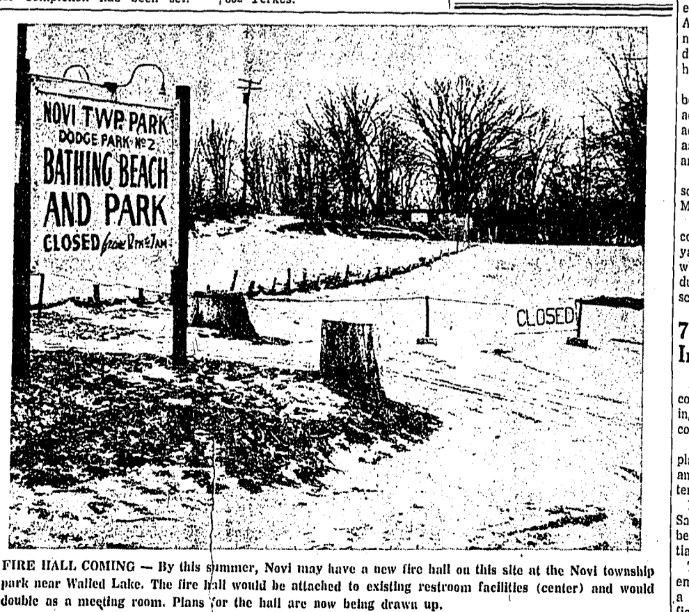
FIRE HALL COMING — By this summer, Novi may have a new fire hall on this site at the Novi township work near Walnut Lake. The fire hall will be attached to existing fire hall facilities (center) and would double as a meeting room. Plans for the hall are now being drawn up.

Novi was host last night to a meeting of the re-activated southwestern Oakland County Development Commission.