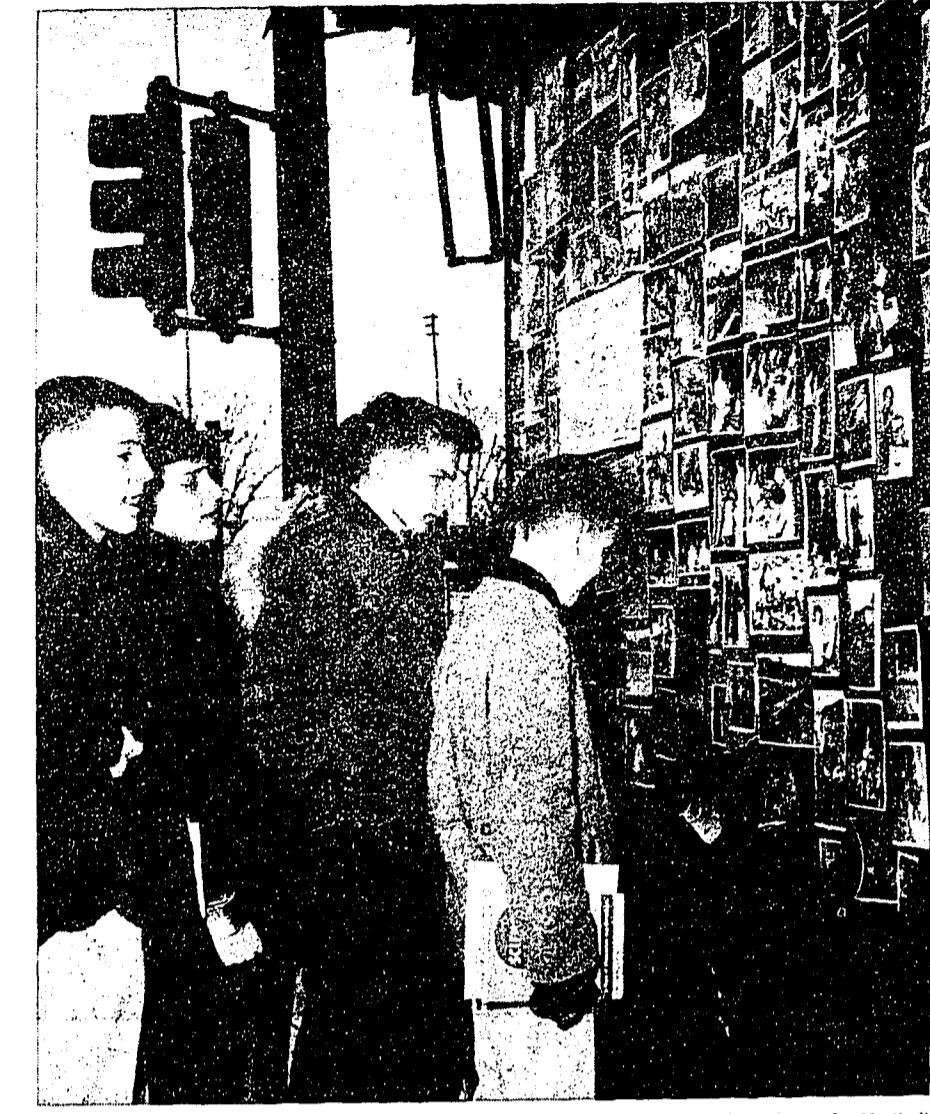
THAT'S ME — The Record's front window was one of the most popular gathering places in Northville this week as hundreds of photographers displayed their annual picture sale. The photos appeared in the Record and Novi News during 1957. Youngsters especially gobbled them up — to fill out their scrapbooks or to keep as a reminder of their current fashions.

Northville, Novi and Wilson residents were urged this week to donate several hours a week for helping community agencies during the year. The plea came from United Community Services, which seeks volunteers for more than 600 health, welfare, cultural and civic agencies in this area.