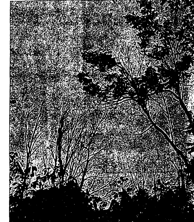
DUTCH ELM DISEASE? No, but the trees are just as dead. The 15 or 20 trees in the distance are located in a swamp next to the Novi township park and have died from too much water.

Hughes' No-Hitter Not Quite Enough The Waller Lake All-Stars bowed out of the state Babe Ruth tournament Saturday after moving into the district finals on two victories, including a no-hitter by Wixom's Jim Hughes.