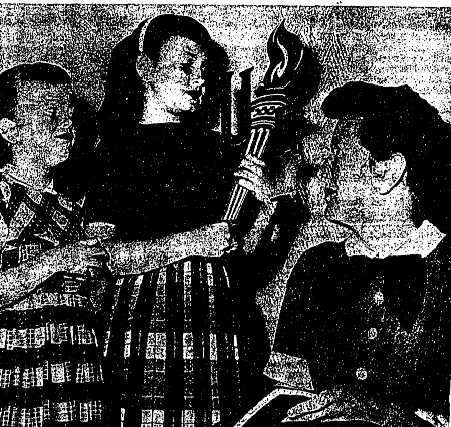
GIVE ONCE... FOR ALL — The annual Torch Drive will begin next Wednesday in Novi and Wixom.

Wixom Residents In New Lions Club. The newly-organized Wixom-Walk-Ed Lake Lions club will meet next week at the Wixom community center.