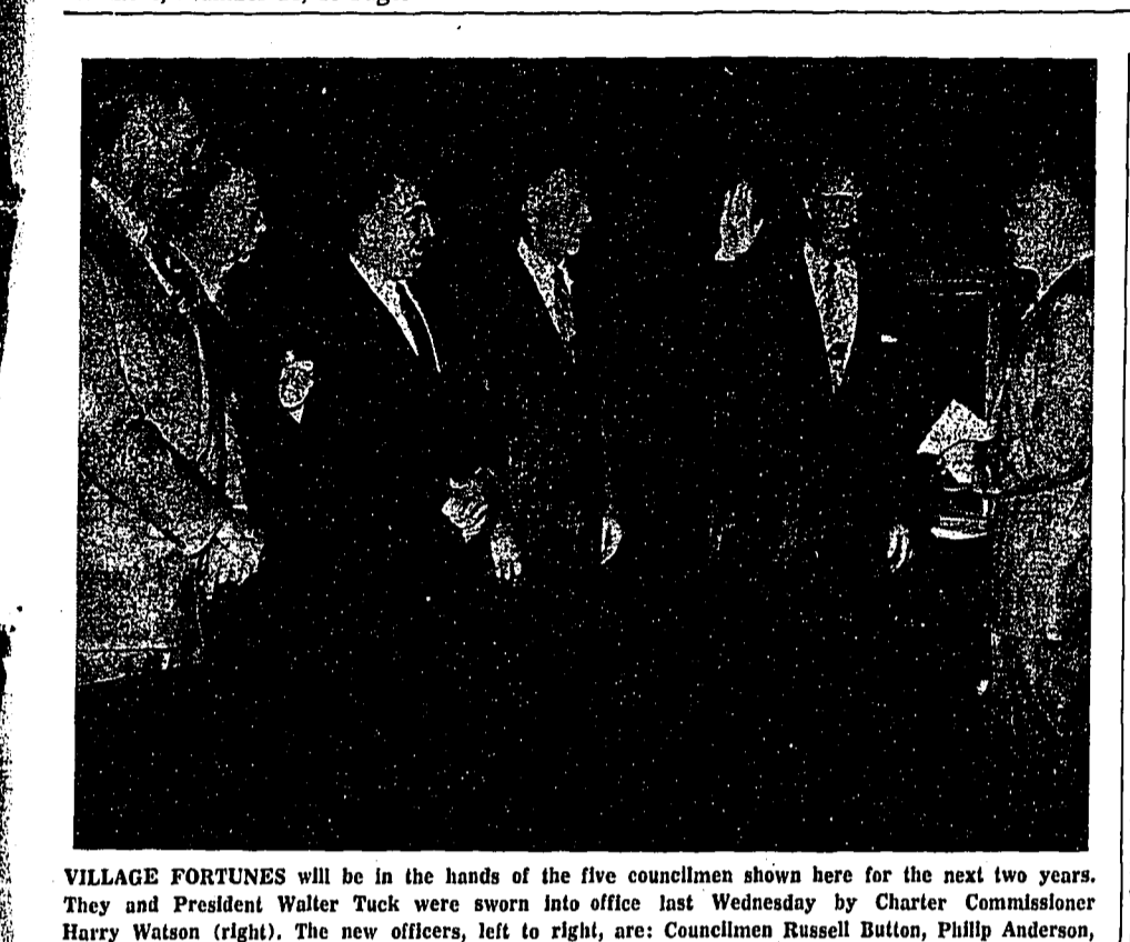
VILLAGE FORTUNES will be in the hands of the five councilmen shown here for the next two years.