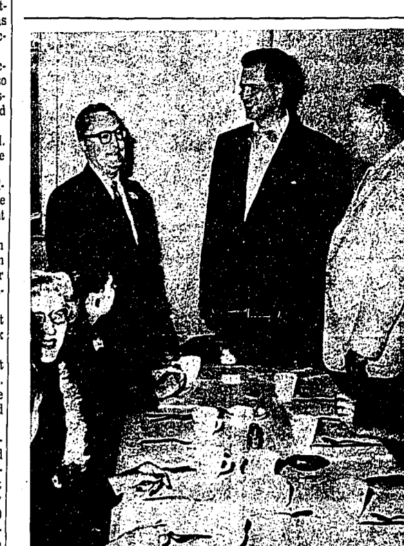
SOAPY IN NOVI — Some 200 persons turned out to greet Gov. G. Mennen Williams when he visited Novi for Governor's Day Sunday.