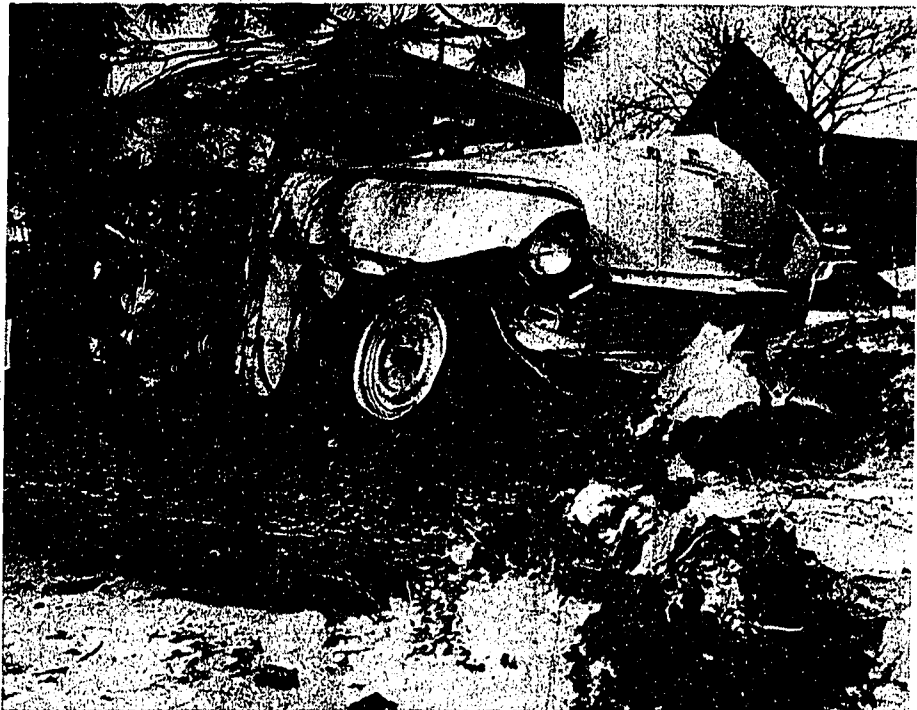
HOLIDAY LESSON — Traffic authorities, who are warning motorists to drive with particular caution during the holidays, are certain most drivers wouldn't survive the crash above in which Walter Boyd of Plymouth, miraculously escaped death Saturday. His car plunged from the highway on Seven Mile near Northville road, struck a culvert and hurled high into a tree 15 feet away. Boyd, who was thrown through the windshield, walked away with only minor injuries.