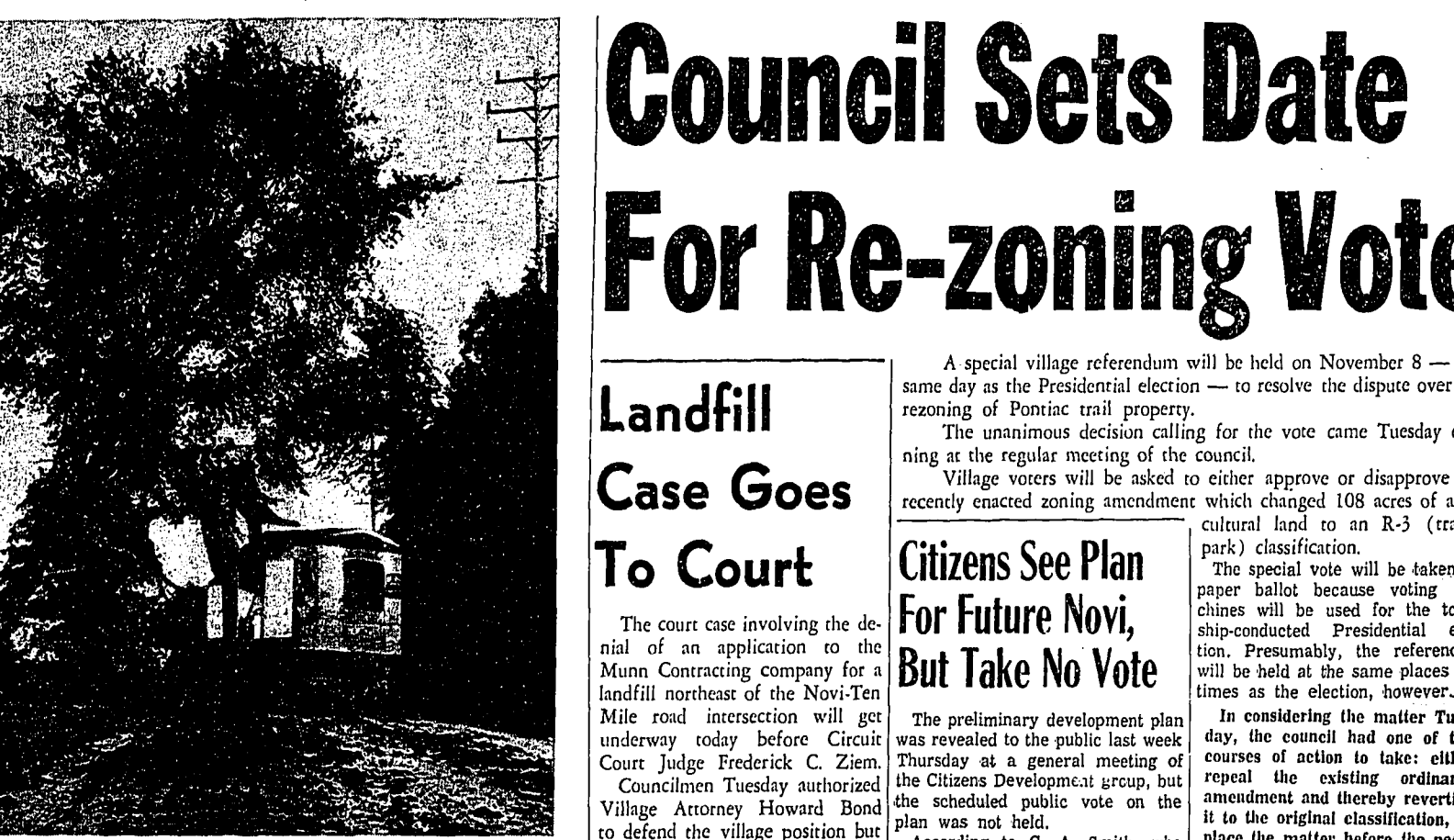
TIMBER — Removal of trees along Novi road started Tuesday afternoon and is expected to be completed this week. Above a shovel pulls at a stubborn tree while a bulldozer pushes from the rear.