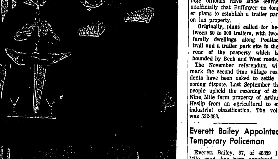
Landfill case involves the denial of an application for a landfill by Munn Contracting company for a landfill northeast of the Novi-Ten Mile road intersection.