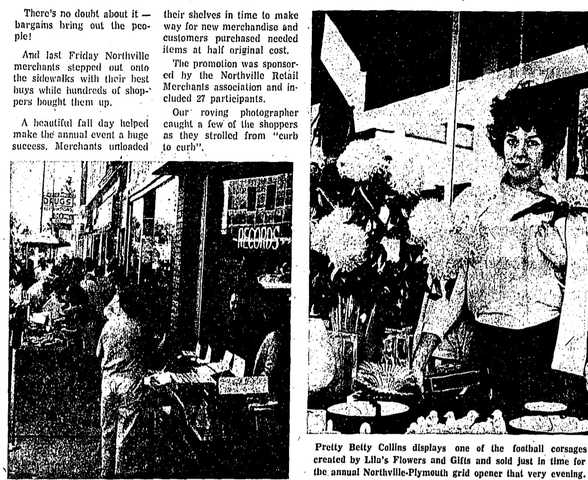
There's no doubt about it - their shelves in time to make way for new merchandise and customers purchased needed items at half original cost.