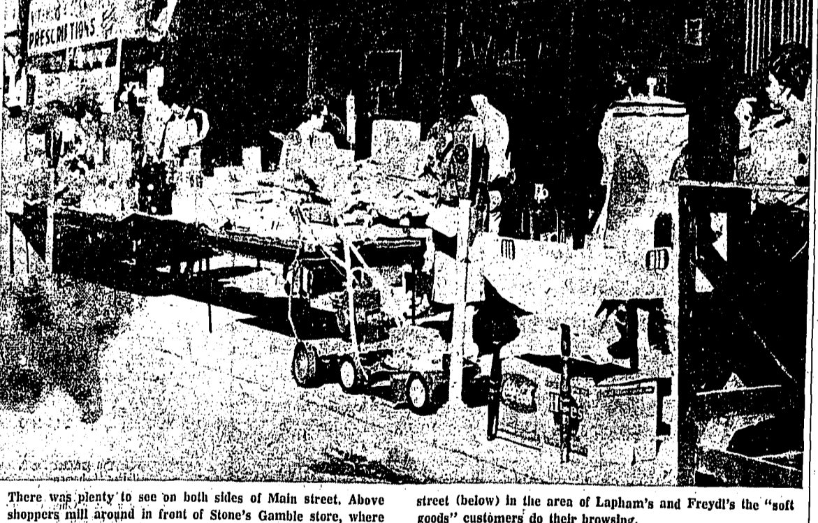
No passing here. Fruit traffic had to move to the street as shoppers mill about sidewalk stands.