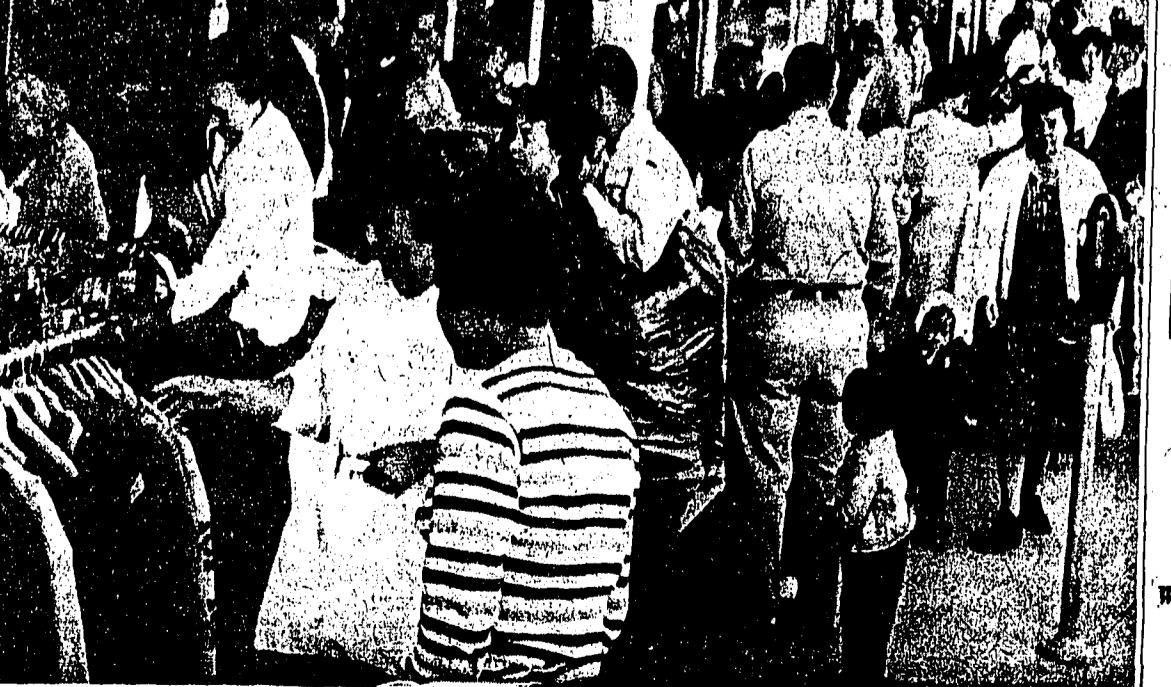
Prices were low, that it was difficult not to buy, even if you didn't need them.