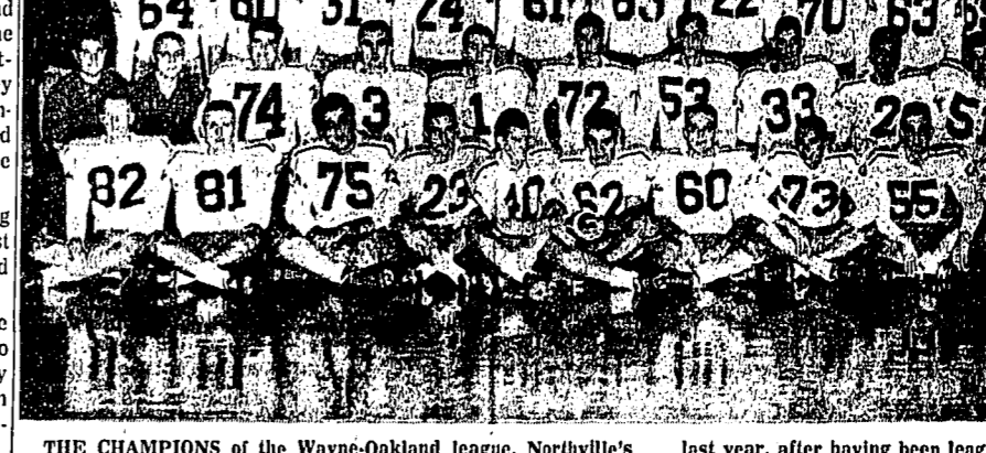
THE CHAMPIONS of the Wayne-Oakland League, Northville's Mustangs, are pictured above. The high school gridder took all seven of their W-O league games this season to recapitulate the team's perfect season. They had lost possession of the title last year, after having been annual champs four years running. They will be honored at an annual awards banquet December 6 to be held in the Methodist church under the sponsorship of the Wayne-Oakland League, which the Mustangs also gained All-State recognition as the number four ranked Class B team.

One-half million dollars is the estimate of the cost of the main trunk and treatment plant of a sanitary sewer system recommended by the city council. The estimate includes $100,000 for the main trunk, $200,000 for the treatment plant, and $100,000 for the installation of a sanitary sewer system.