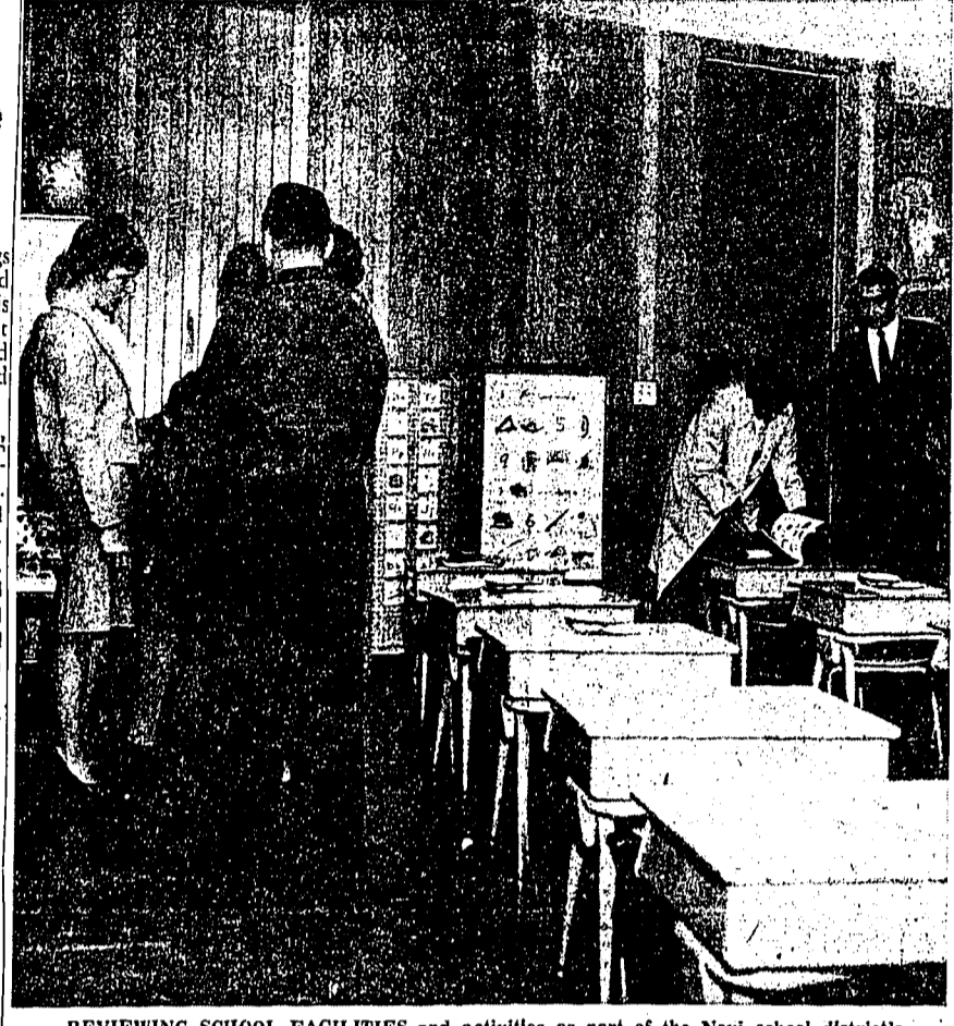
REVIEWING SCHOOL FACILITIES and activities as part of the Novi school district's observation of National Education Week Tuesday are several area parents. The group on the left is discussing classroom programs with an Orchard Hills elementary teacher, while interested parents to the right look through a display of a school child's work.