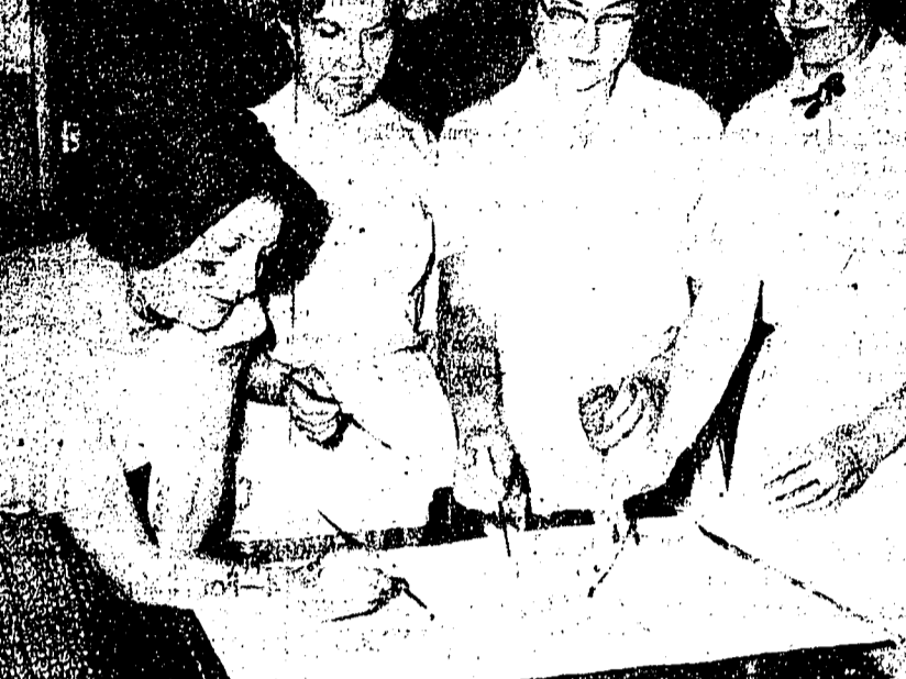
OLD FASHIONED FOURTH - Members of the Women's Society of Christian Service ready to sign for an old-fashioned ice cream social tomorrow under the big top at the First Methodist church, Northville.

Members of the Women's Society of Christian Service ready to sign for an old-fashioned ice cream social tomorrow under the big top at the First Methodist church, Northville.