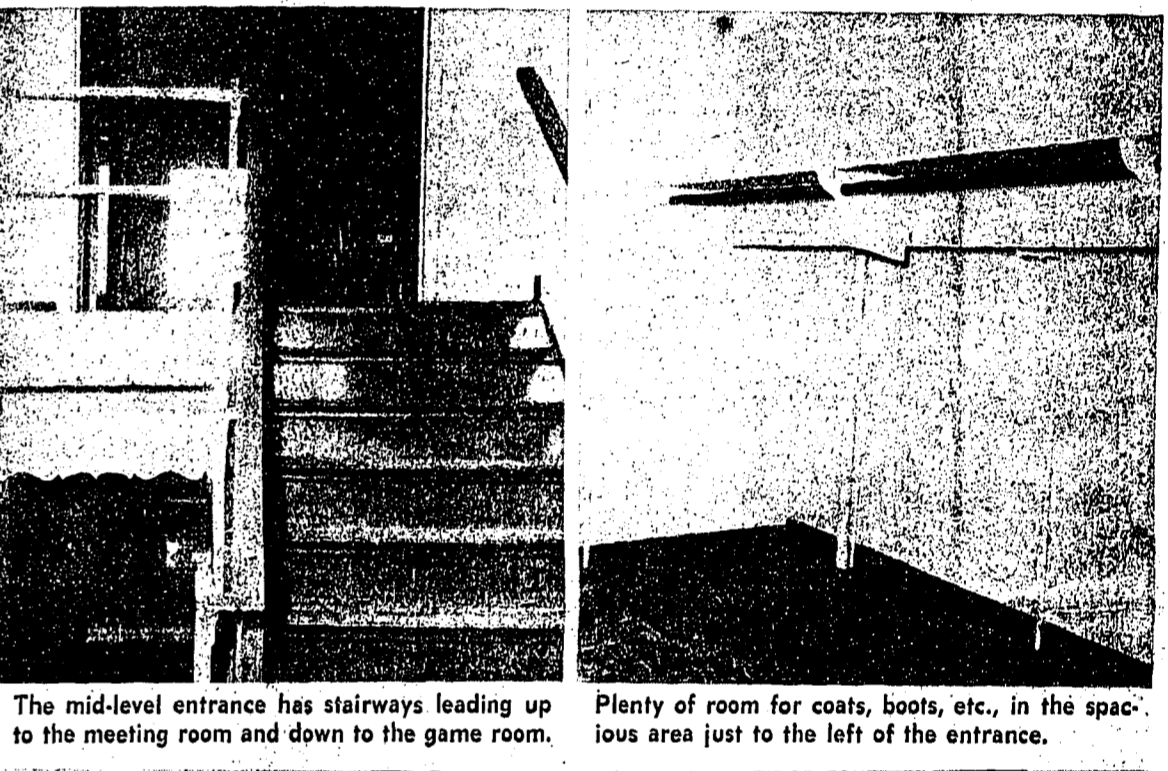
The mid-level entrance has stairways leading up to the meeting room and down to the game room. Plenty of room for coats, boots, etc., in the spacious area just to the left of the entrance.