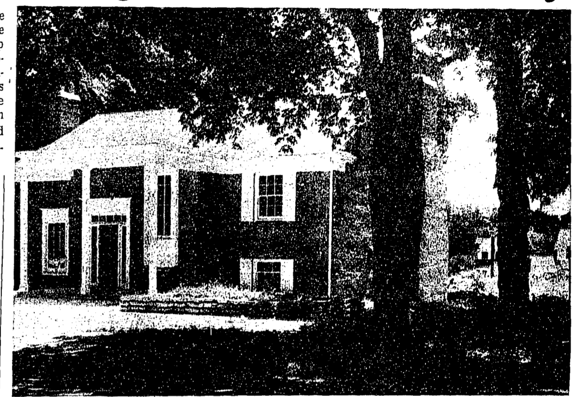
The community's new Cady street scout-recreation building is now open and busy with activity. Grounds in the rear area will be used for ice skating, day camp and archery in the future.

Although dedication ceremonies are not planned until fall, Northville's new scout-recreation building is getting plenty of use — dedicated or not. The building, recently completed by Harley Cole and Son, Northville builder, is a source of pride to the entire community. Complete cost of the facility will probably run close to $30,000. About half of these funds were collected by public donations. The city provided the land and the other half of the building cost from sale of the old scout building on Dunlap street. This summer the building serves as headquarters for the community recreation program, which includes some 900 youngsters. Year-round activities bring the total participation to about 1,100. A playground area in the back of the tri-level building is planned to include two blacktopped skating rinks, which in summer will become tennis and basketball courts. A permanent archery range and playground for smaller tots will also be included. In September area scouts will begin using the building for their meetings and special activities. The Northville Cooperative Pre-School Play Group will also conduct its program in the building. Director Conley explains that the building is for the use of organized youth groups either sponsored or approved by the recreation department.