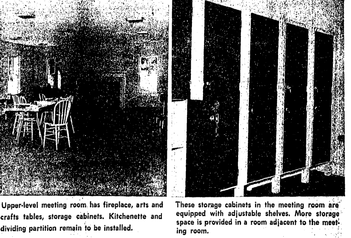
Upper-level meeting room has fireplace, arts and crafts tables, storage cabinets. Kitchenette and dividing partition remain to be installed. These storage cabinets in the meeting room are equipped with adjustable shelves. More storage space is provided in a room adjacent to the meeting room.