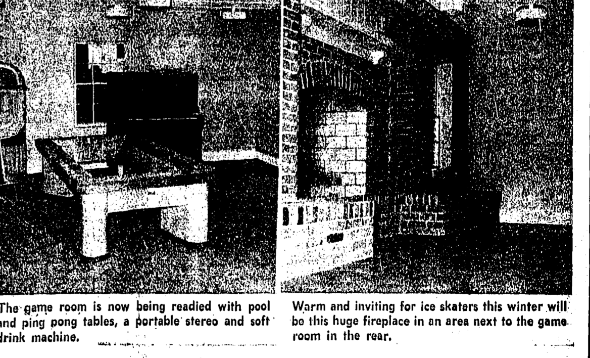
The game room is now being readied with pool and ping pong tables, a portable stereo and soft drink machine. Warm and inviting for ice skaters this winter will be this huge fireplace in an area next to the game room in the rear.