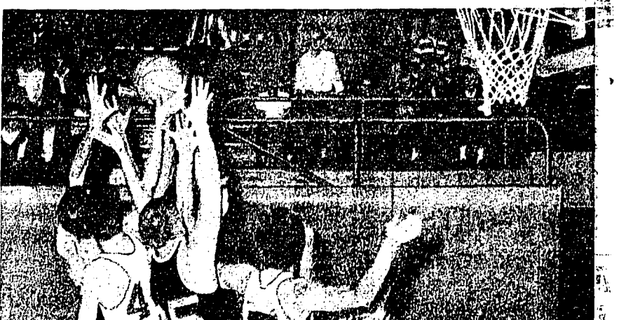
HARDWOOD BALLET — Nearly every player from both sides joined here under the basket in a ballet-like performance while scrapping for a rebound.