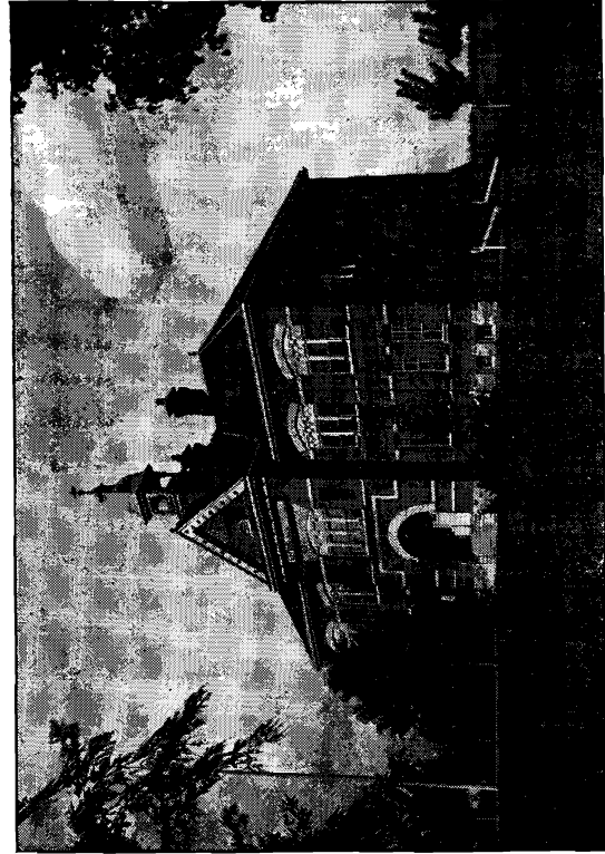
OXFORD HIGH SCHOOL ERECTED, 1886.