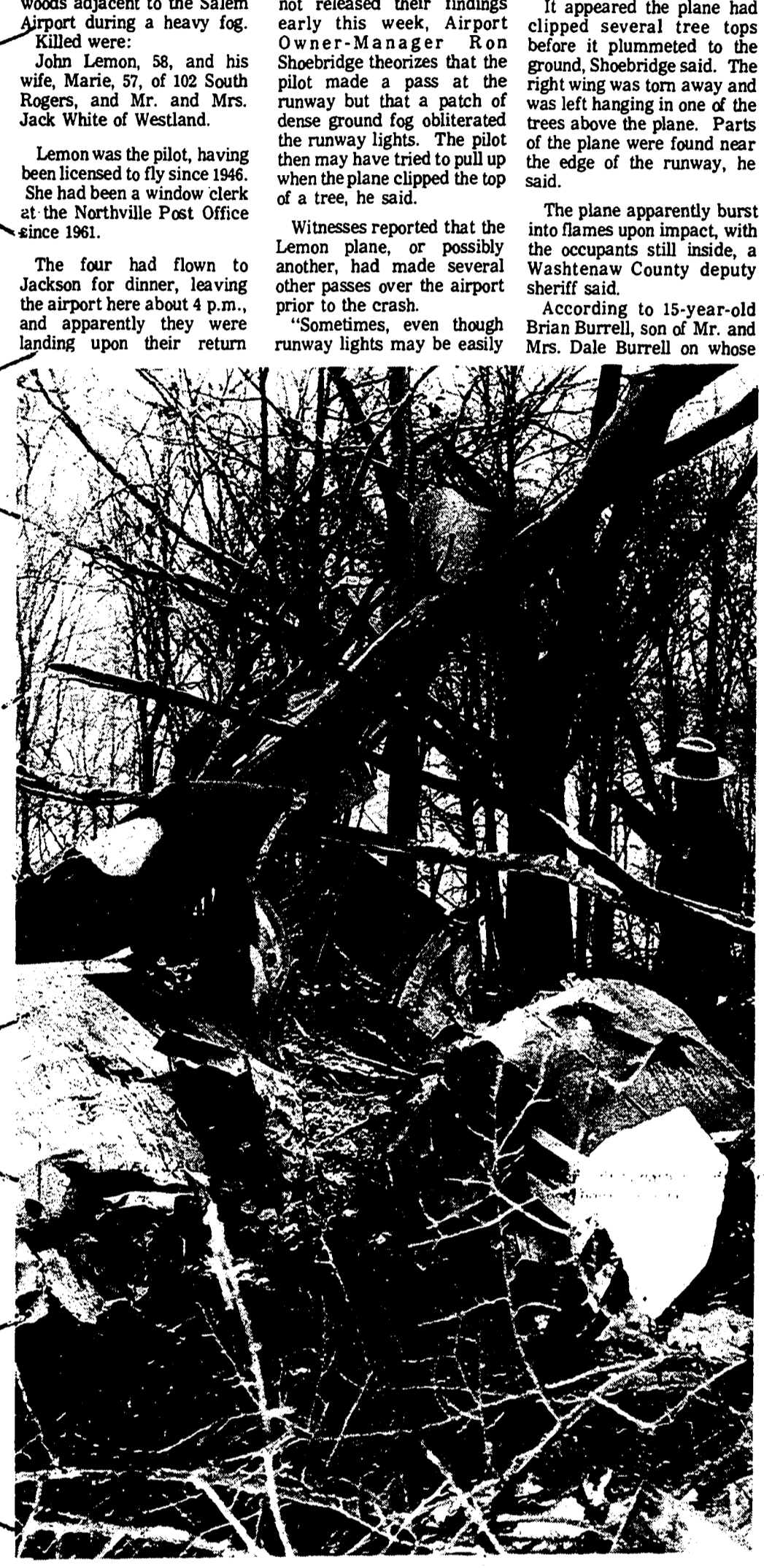
What's Left of The Single Engine Plane That Crashed in Salem